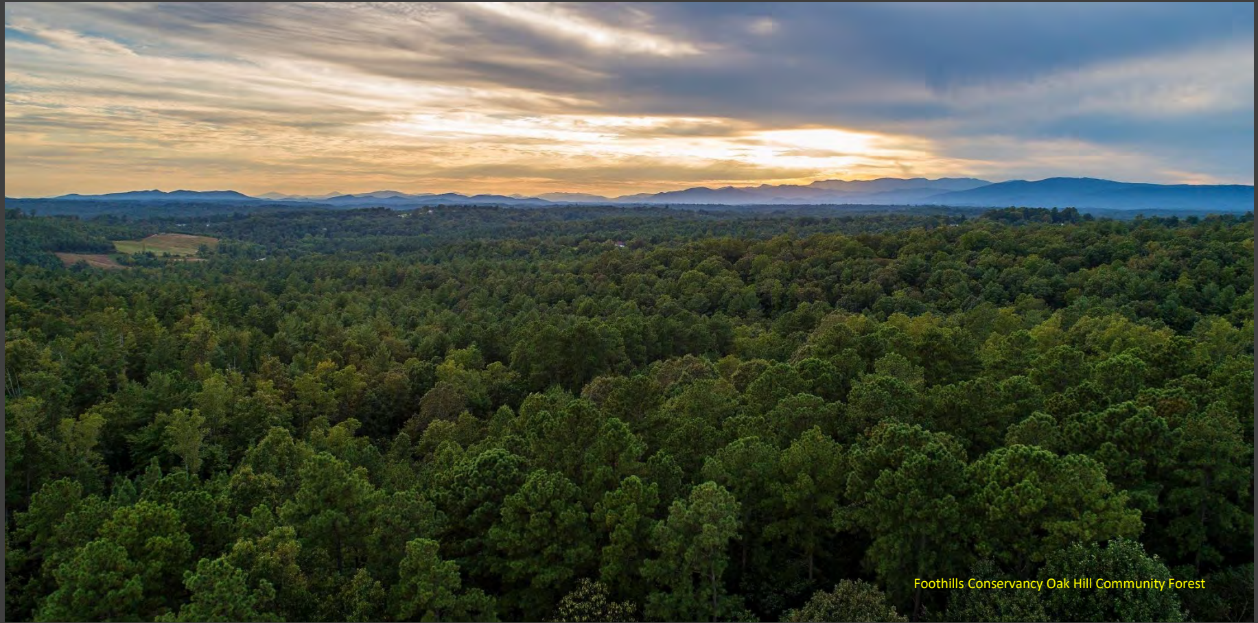
Foothills Conservancy Oak Hill Community Forest